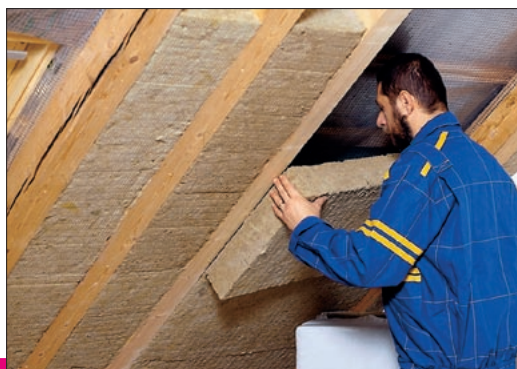
Example of product application Isover UNI

7) FU = functional unit (1 m 2 of insulation by 100 mm thick for live cycle phases A1-A3).