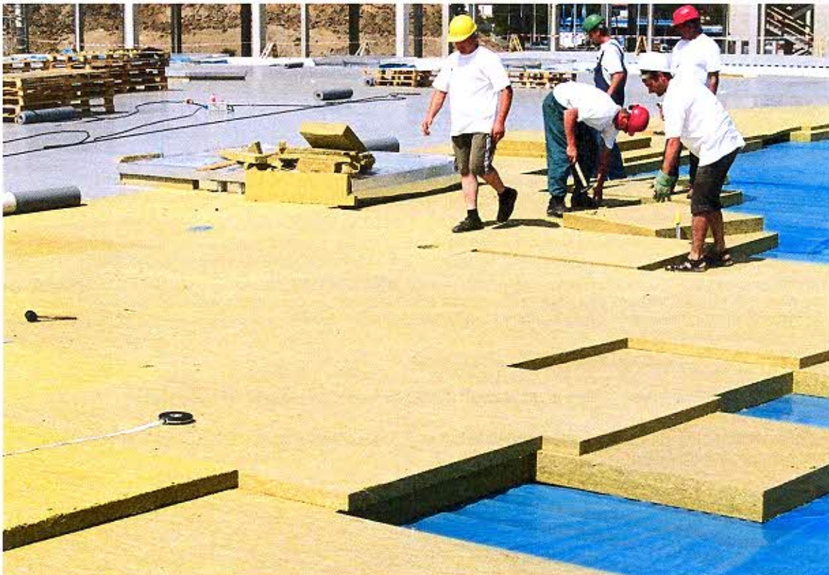
Isover S as a top layer on flat roof mineral composition.

Isover S slabs are designed for thermal, acoustic and fire insulation of the flat roofs. They are usually laid in one top layer, that covers bottom slabs. There is a suitable combination with Isover T or Isover R slabs which are to be laid as an underlayer with gravity flow systems Isover SD and Isover DK as well as with Isover AK attic wedge blocks which help to change the horizontal direction of the waterproofing into the perpendicular direction. Waterproofing membrane can be applied directly on the Isover S slabs (glued, mechanically attached or with a load). If there is an expectation of an increased activity on the roof (due to often roof inspection, technological devices servis,...), solidifying paths is a must, for a roof damage prevention.