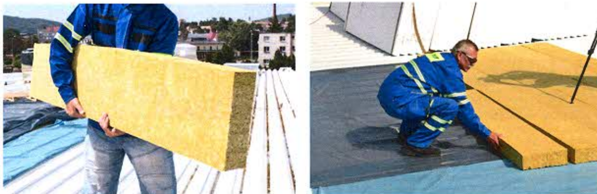
Example of use Isover LAM 50.

These large-format lamellas are made of Isover mineral stone wool with perpendicular fibres. Large-format lamellas can fully replace standard slabs, that are mostly used in flat roof insulation systems. Due to their unique properties, they meet obligations to mechanical resistance with much less densities than regular slabs. They can be used as bottom or middle layer into multiple layer systems. It is necessary to combine them with covering top layer e.g. Isover S (or others).