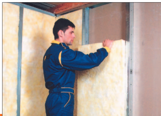
Example of product application ISOVER Piano