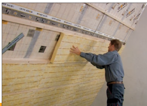
Example of product application Isover MULTIPLAT 35

7) FU = functional unit (1 m 2 of insulation by 100 mm thick for live cycle phases A1-A3).